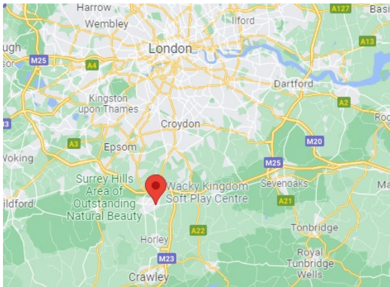
Redhill, United Kingdom