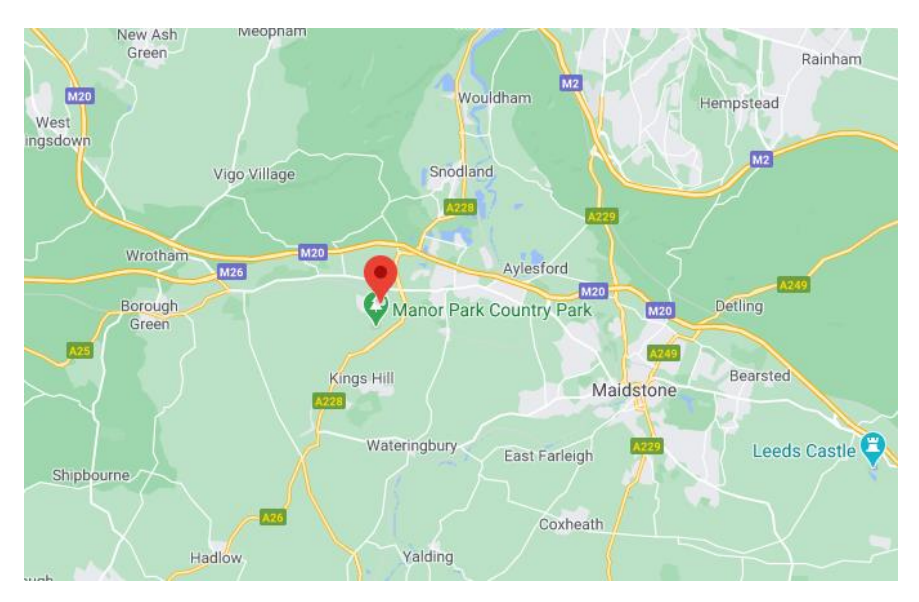
West Malling, United Kingdom