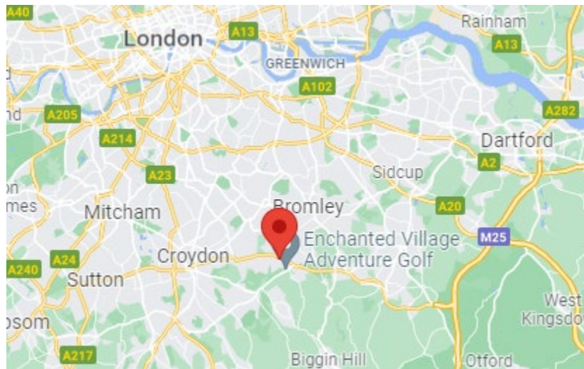
West Wickham, Bromley, United Kingdom