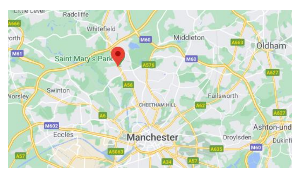
Prestwich, United Kingdom