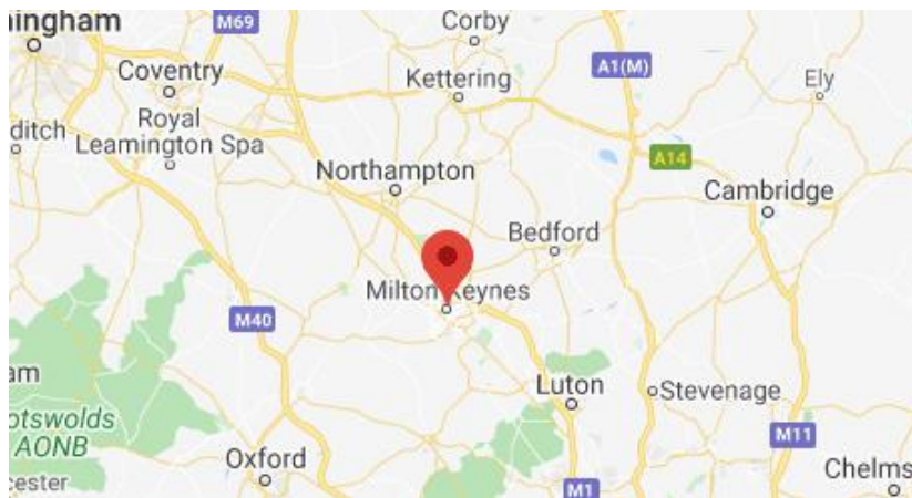
Milton Keynes, United Kingdom